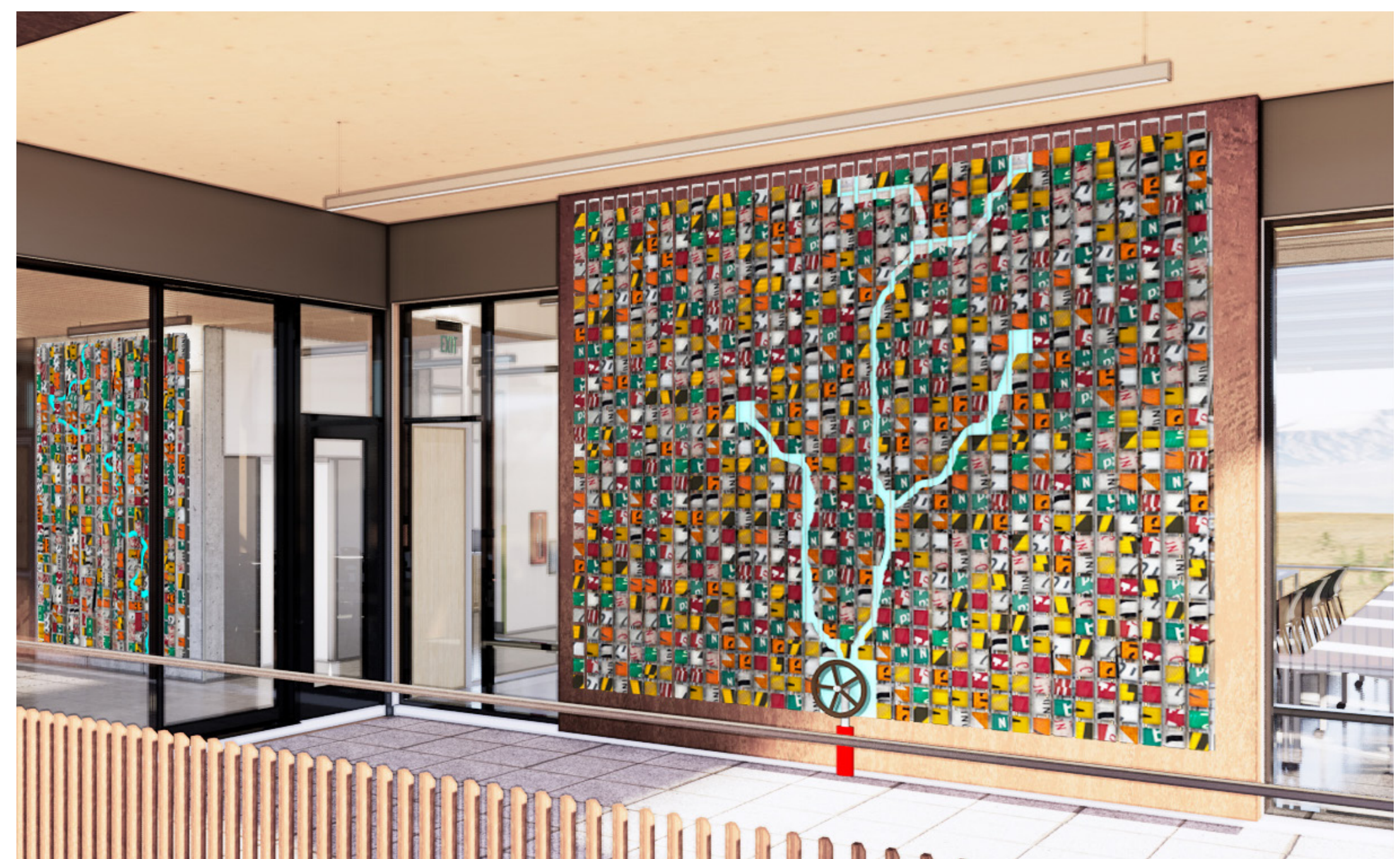
Terrace (14'-6" wide x 12'-0" tall)

All three tapestries are fabricated from castoff aluminum traffic signs. Their colors and graphics create a rich mosaic and their prismatic film surfaces provide a surprising glow for nighttime illumination. Suspended behind these strands of sign fragments is a curtain of mirror-finish stainless steel plates. These mirrors will add a mysterious depth to the artwork. The slight movement of air in the lobby will create a gentle shimmering, the illusion of water flowing under the surface.