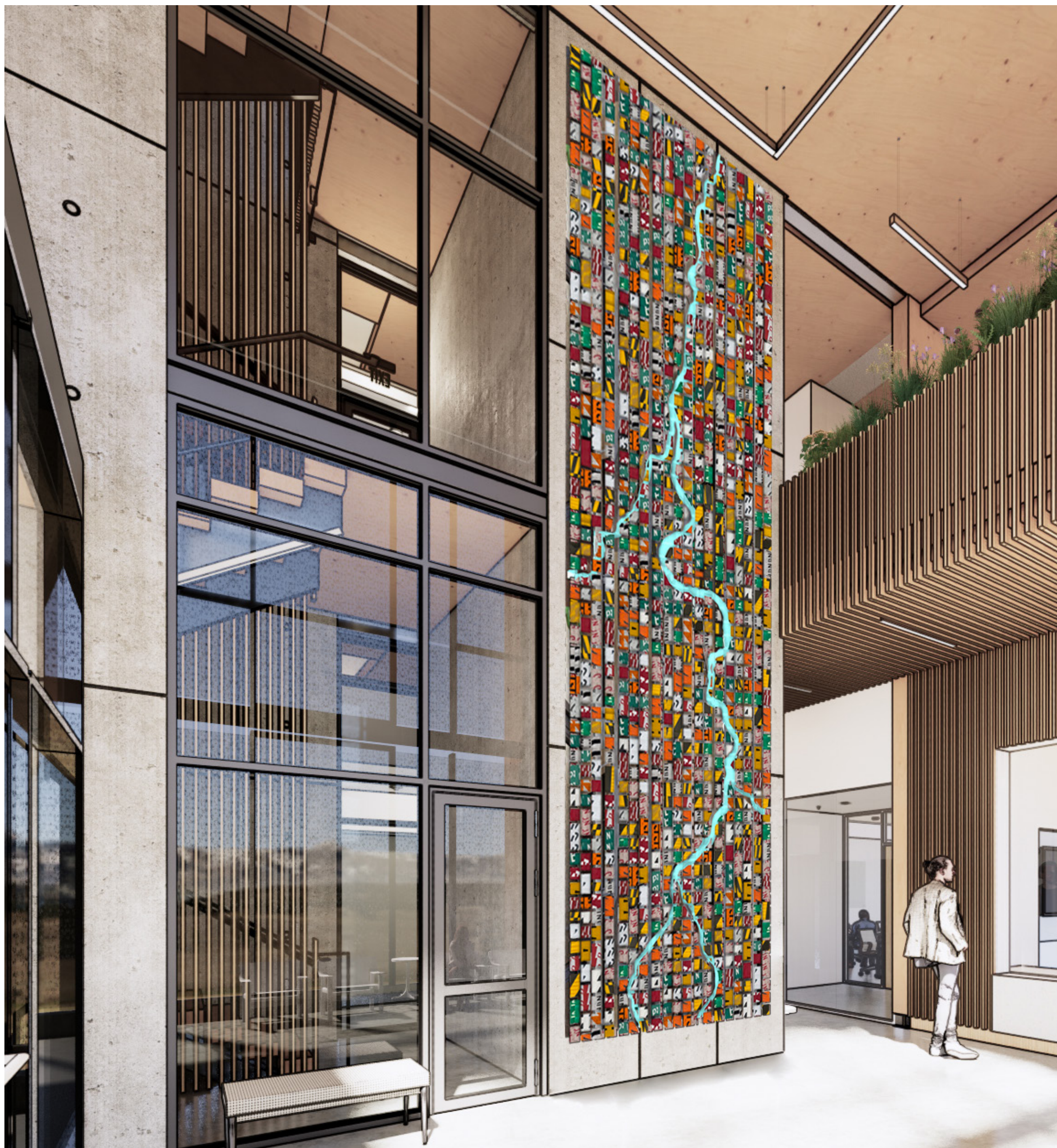
1st Floor Lobby (7'-10" wide x 27'-10" tall)