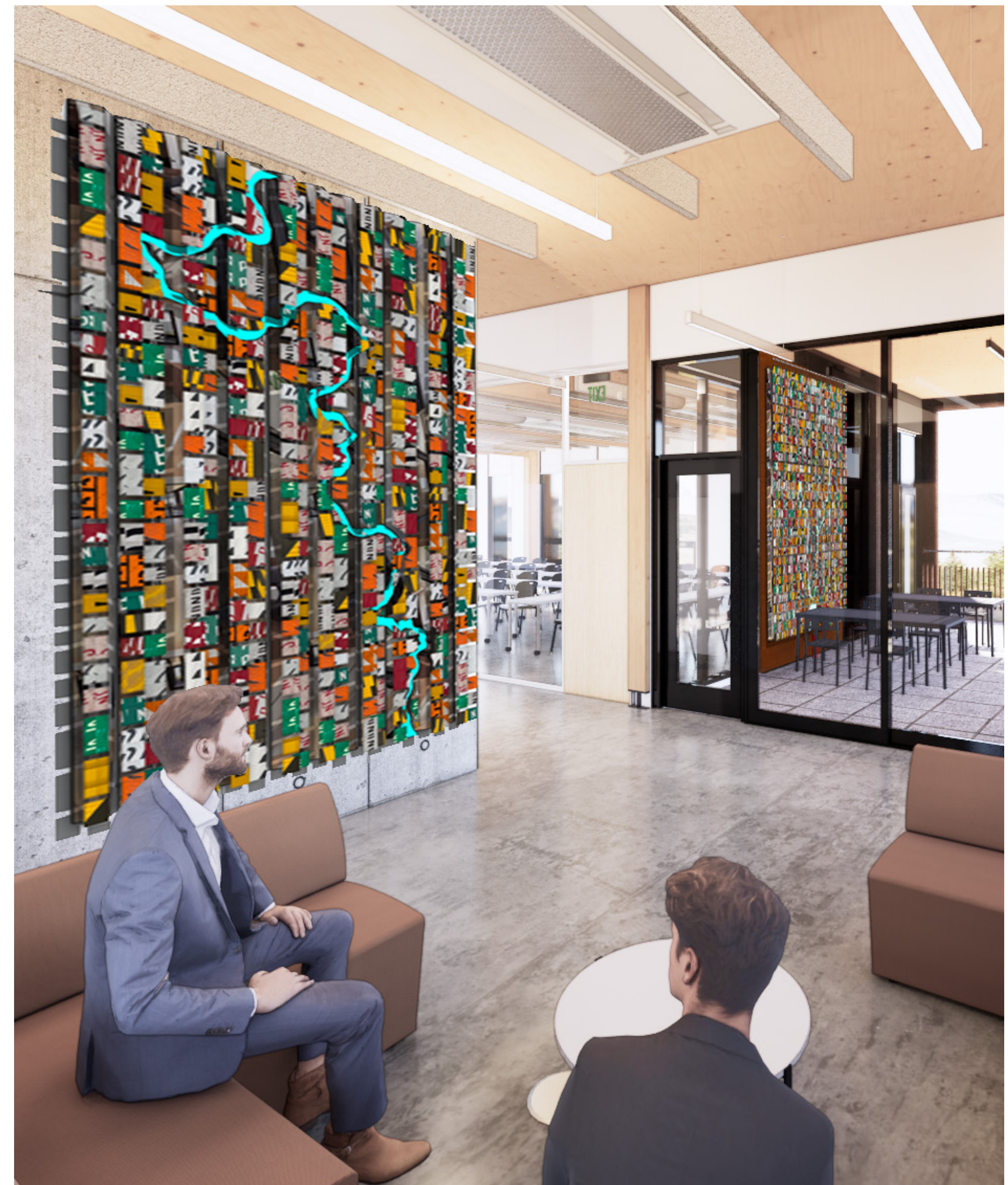
3rd Floor Lobby (7'-10" wide x 12'-8" tall)

The tapestries suspended in the first- and third-floor lobbies illustrate the course of the Deschutes River as it flows from Benham Falls, through Bend, and down toward the new Public Works Campus.