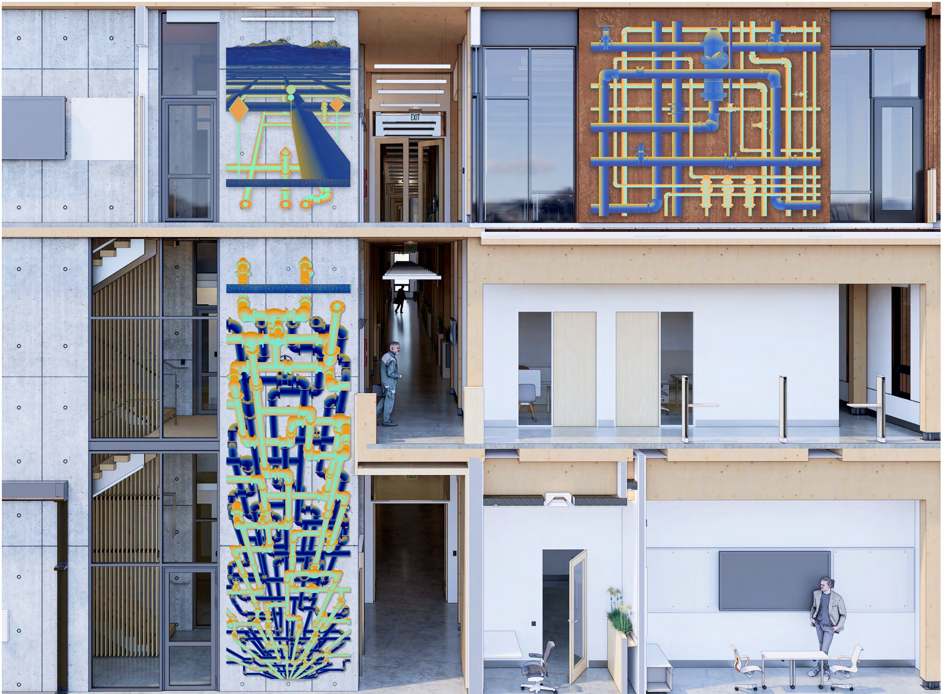
building section of artwork areas