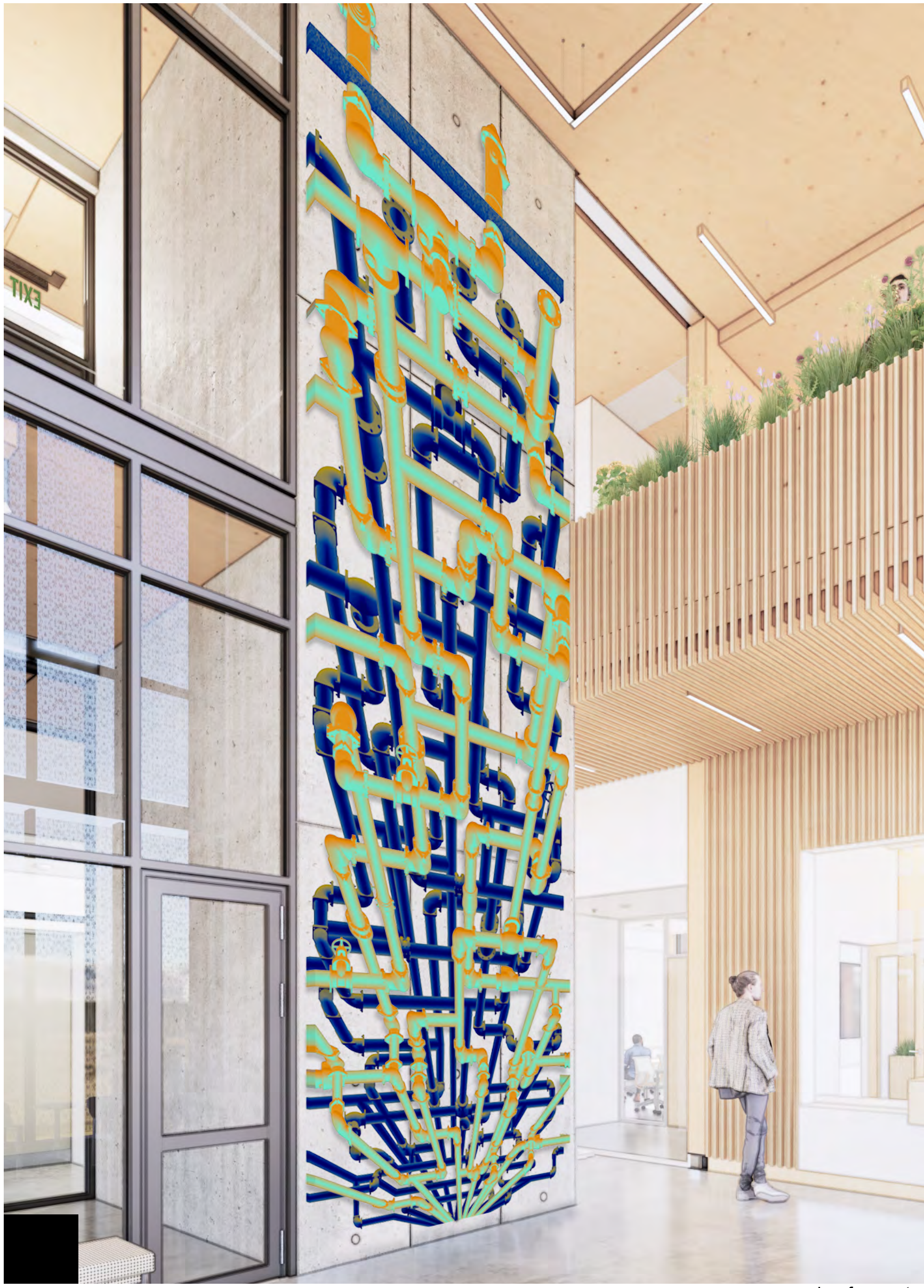
view from entry