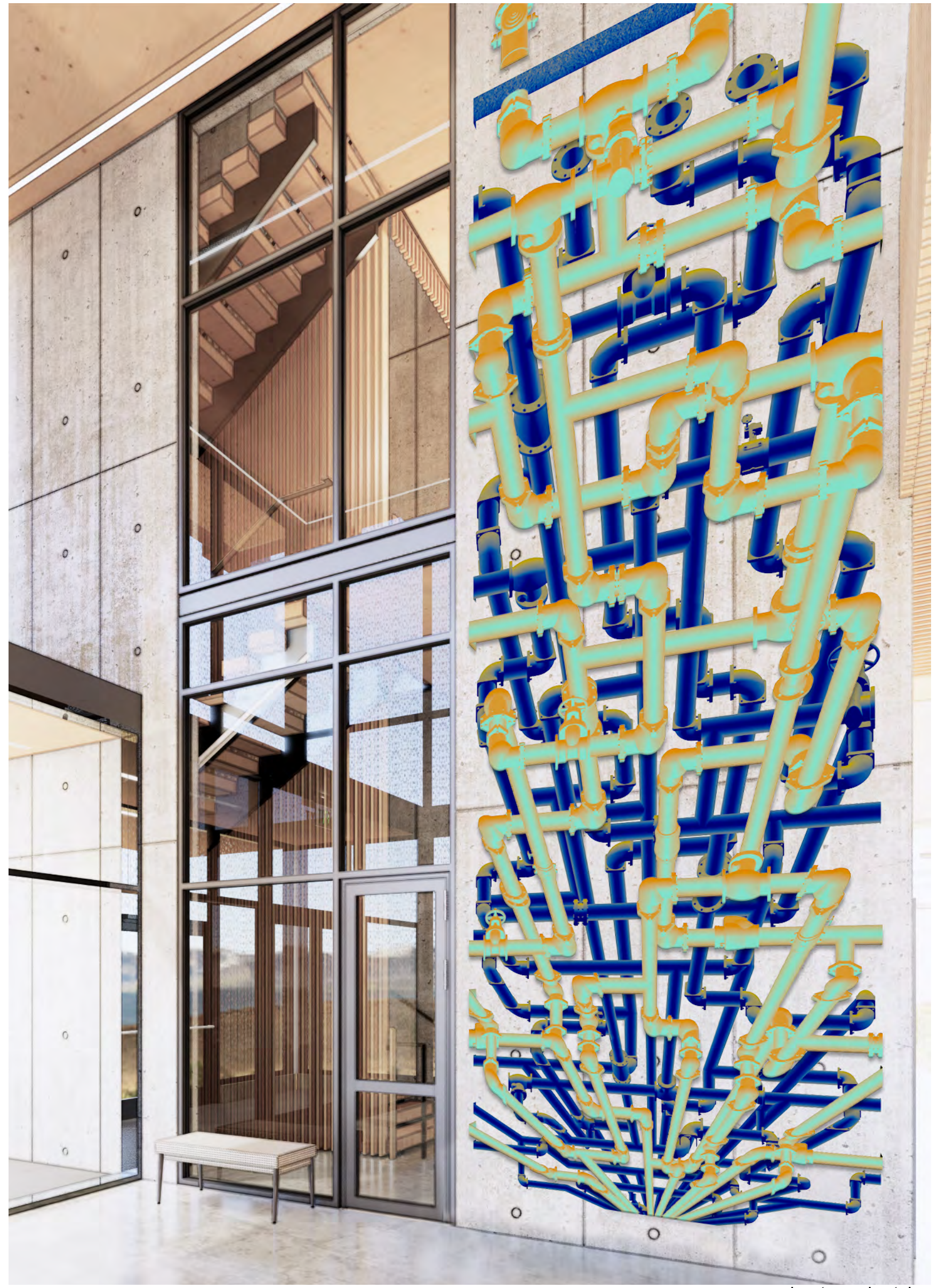
view towards stairs