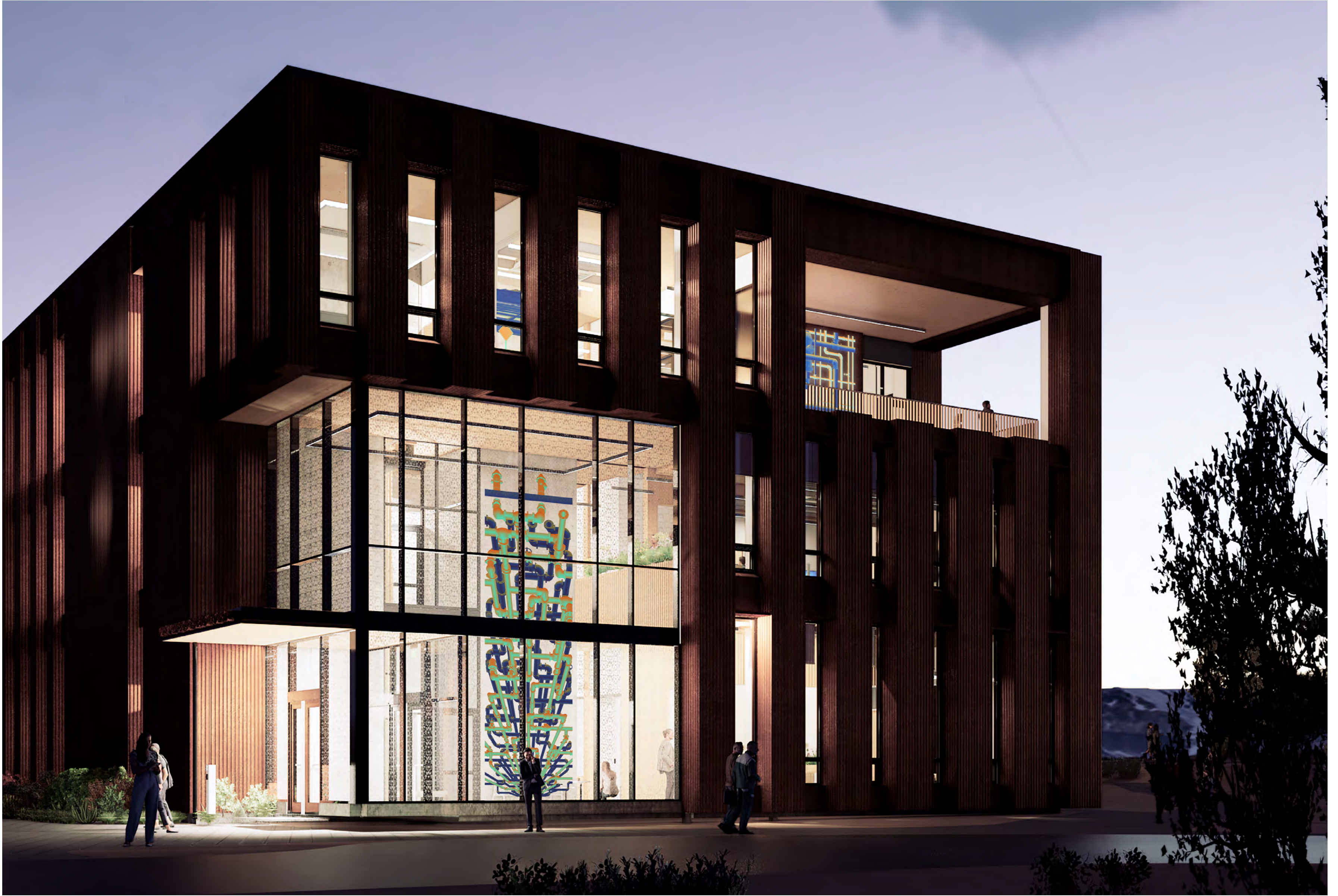
exterior view at dusk